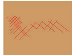
Line map of Libyan data

Approximately 515 kms of 2D data (scanned paper only) in the Sirte Basin is available for evaluation and licensing.