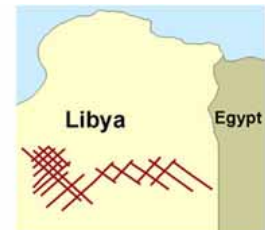
Map of Libyan Data