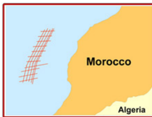
Map of Morocco Data