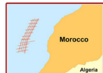
Map of Moroccan Data